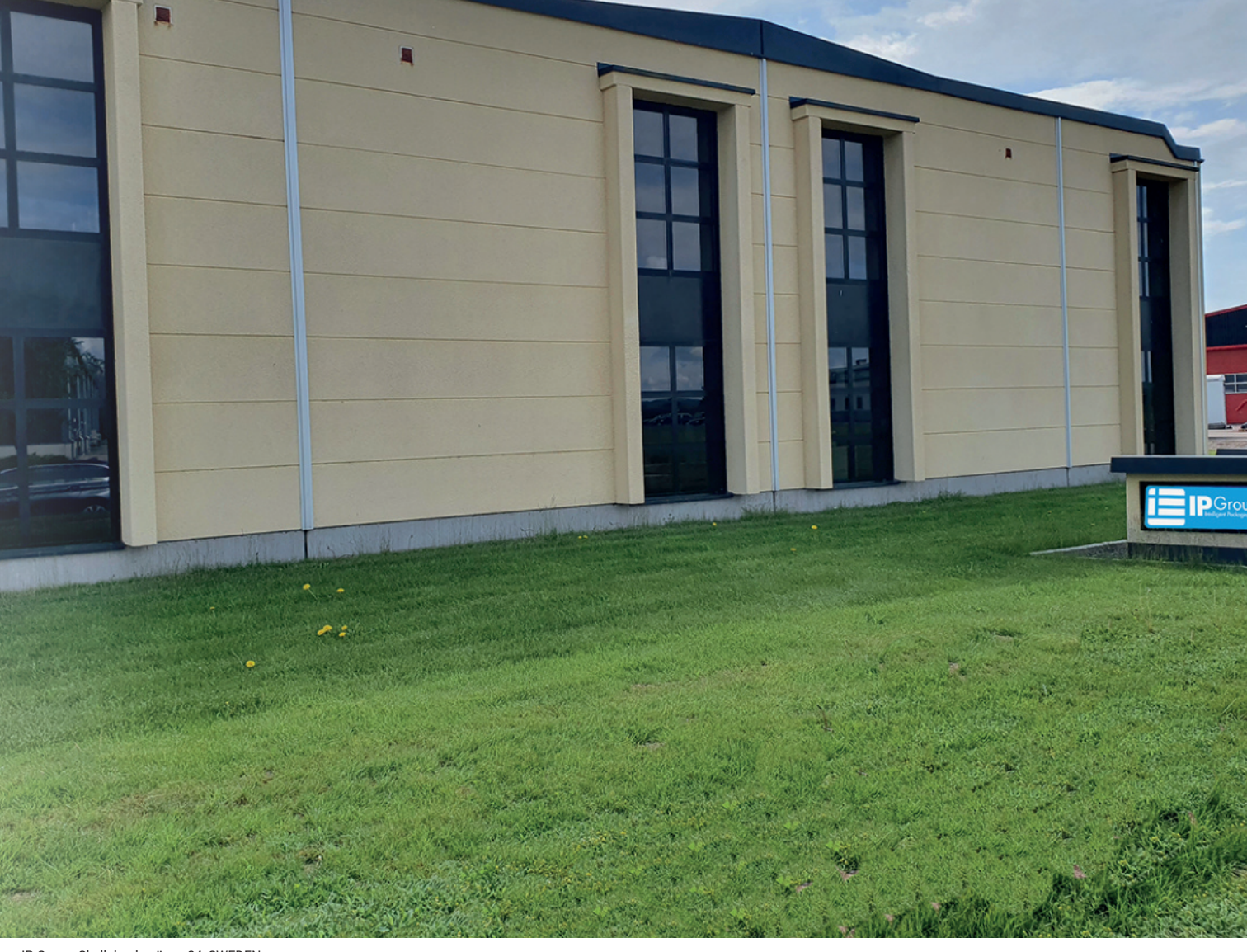
IP-Group, Skallabackavägen 24, SWEDEN